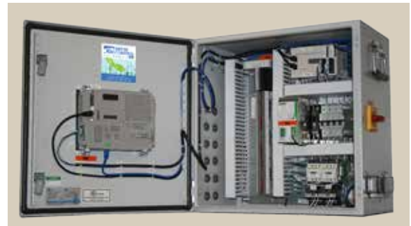
ADVANCED CONTROL PANEL OPTIONS

We understand the complex commercial construction process, including the extensive documentation required to bring your project to fruition. We also offer a wide array of BAS integration options.