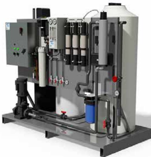
ORIGINAL PLAN DESIGN