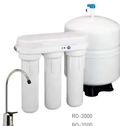
RO-3000 RO-3500 (with monitor)

The RO-3000 and RO-3500 each produce up to 7.6 gallons of top quality water per day, depending on your operating conditions. The RO-3500 features an electronic water quality monitor to indicate when to change the RO membrane. Both systems come complete with cartridges, a long reach faucet, and installation hardware.