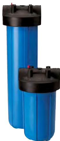
Big Black not shown

FOR LARGE-CAPACITY, HIGH FLOW APPLICATIONS