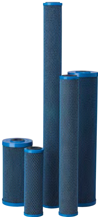
— Features Fibredyne™ technology —

SEDIMENT FILTRATION AND CHLORINE TASTE & ODOR REDUCTION IN A SINGLE CARTRIDGE