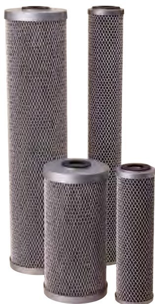
— Features Fibredyne™ technology —

IDEAL FOR APPLICATIONS WITH PRESSURE DROPS AND LOW FLOW