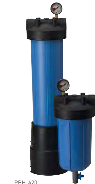
PBH-420 (shown with bag vessel stand, sold separately)

OUTSTANDING CHEMICAL COMPATIBILITY IDEAL FOR USE IN A VARIETY OF LOW-FLOW APPLICATIONS