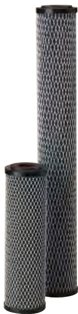
Features Fibredyne™ technology

SEDIMENT FILTRATION AND CHLORINE TASTE & ODOR REDUCTION IN A SINGLE CARTRIDGE