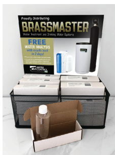
POSTAGE PRE-PAID SAMPLE KITS