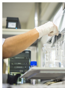
IN-HOUSE WATER TEST LAB