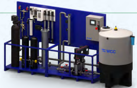
High-Purity Water Systems