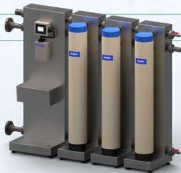
Legionella and Pathogen Control