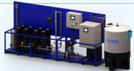
High-Purity Water Systems