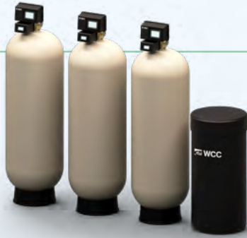
Commercial Water Softening